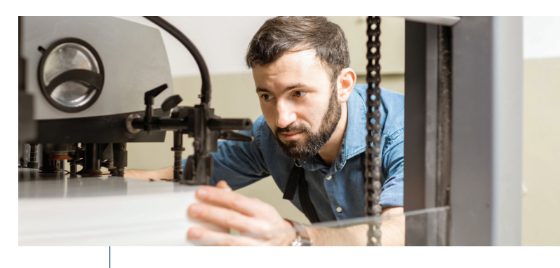
Thanks to improved visibility in production scheduling, deliveries can now be brought forward.

Responsive to its market, LAVIGNE is diversifying by offering a collection of year-at-a-glance calendars, planners, desk pads, paper pads, greeting cards, and advertising objects of all kinds, capitalizing on its know-how and adapting existing production lines.